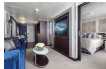
PENTHOUSE SUITE (52.1-58.2 SQM)