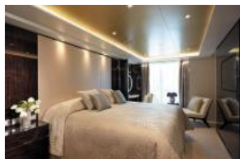
SEVEN SEAS SUITE (75.6 SQM)