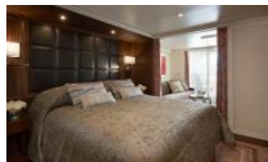
DELUXE VERANDA SUITE (31.7SQM)