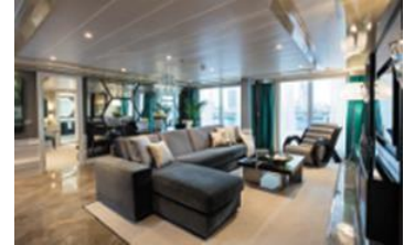
GRAND SUITE (118.6-170.6 SQM)