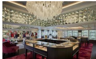
BOUTIQUES & MORE