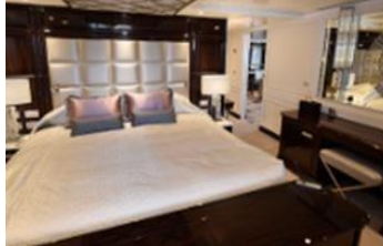
MASTER SUITE (176.1-195.8 SQM)