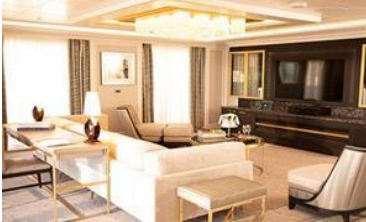
REGENT SUITE (412.8 SQM)