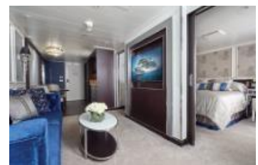
PENTHOUSE SUITE (52.1-58.2 SQM)