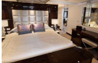
MASTER SUITE (176.1-195.8 SQM)