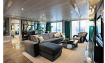
GRAND SUITE (118.6-170.6 SQM)