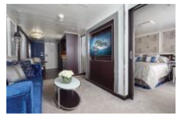
PENTHOUSE SUITE (52.1-58.2 SQM)