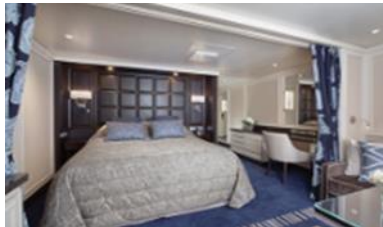
CONCIERGE SUITE /SUPERIOR SUITE (38.6-43.1 SQM)