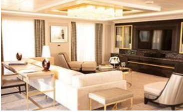
REGENT SUITE (412.8 SQM)