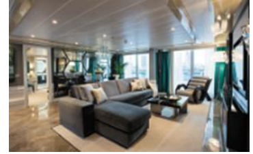
GRAND SUITE (118.6-170.6 SQM)