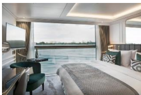
Deluxe French Balcony (17.5 sq.m)