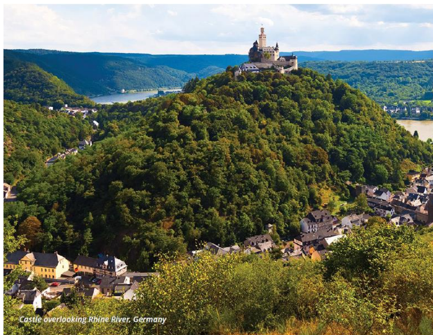
Castle overlooking Rhine River, Germany

8 Days • Amsterdam to Basel • S.S. Elisabeth