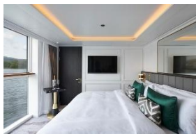
Signature French Balcony (22 sq.m.)