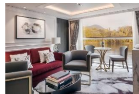
Royal Suite (47 sq.m)