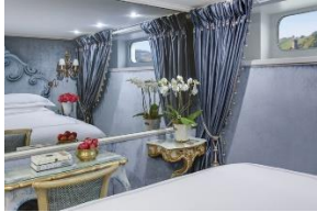
Classic (15 sq.m.)