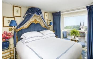
Deluxe Balcony (18 sq.m.)