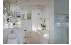
Grand Suite (38 sq.m.)