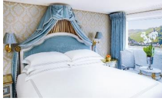
French Balcony (18 sq.m.)