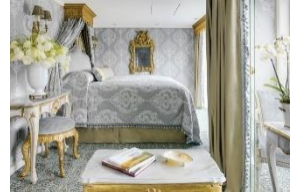
Suite (28.3 sq.m.)