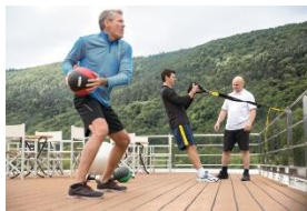
Sun Deck TRX training