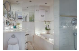
Grand Suite (38 sq.m.)