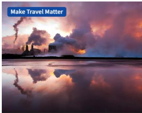
Hellisheiði Geothermal Power Plant Visit