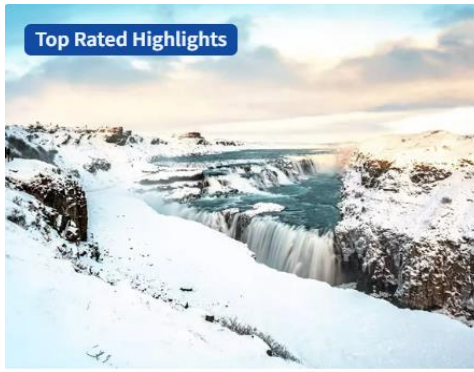
Top Rated Highlights