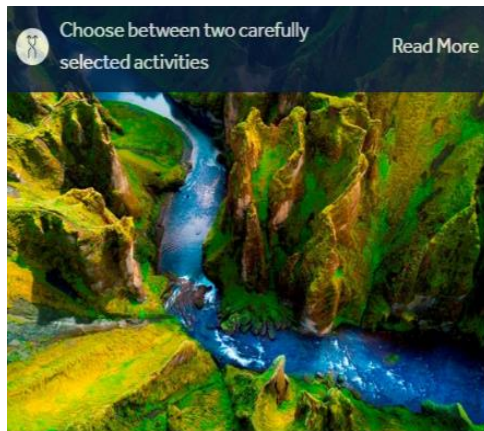
Reykjavik FlyOver Flight-Ride Experience