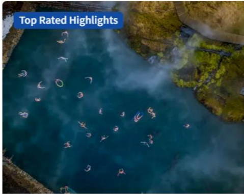
Top Rated Highlights

Meet a Local Family at a Tomato Farm in Fridheimar