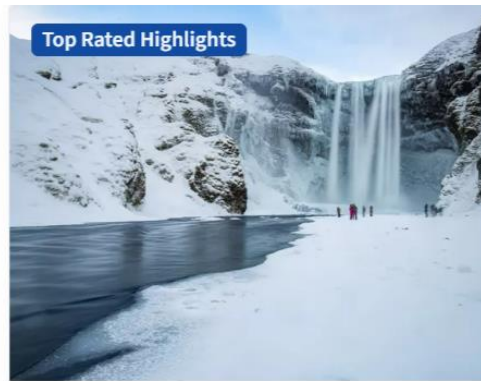
Visit Seljalandsfoss and Skógafoss Waterfalls