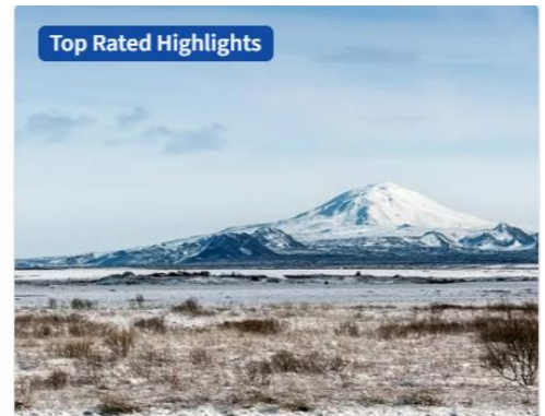
See the Hekla and Eyjafjallajökull Volcanoes