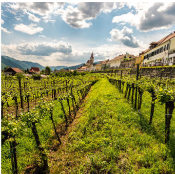
Dürnstein & Melk